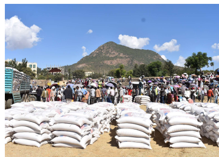
REST food distribution at Adwa town (REST)