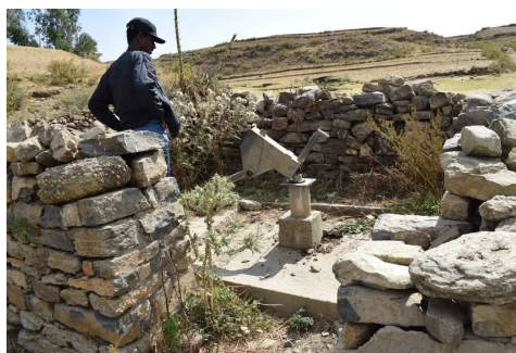
Broken pump and destroyed well wall