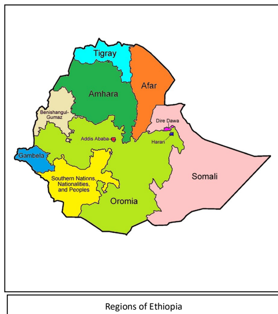
Regions of Ethiopia