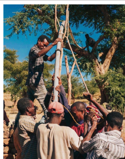
Borehole repair (charity:water)